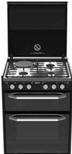
Dual Fuel Fan Forced Oven