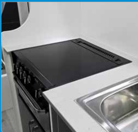
Lid without décor panel

Inquire with your caravan manufacturer or dealer regarding the options for your RV.