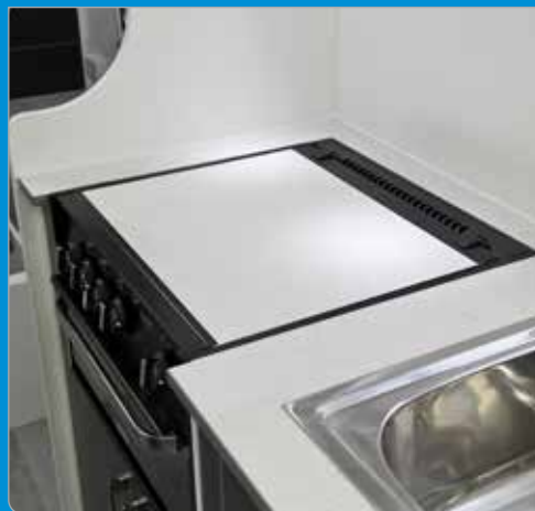
Lid with décor panel